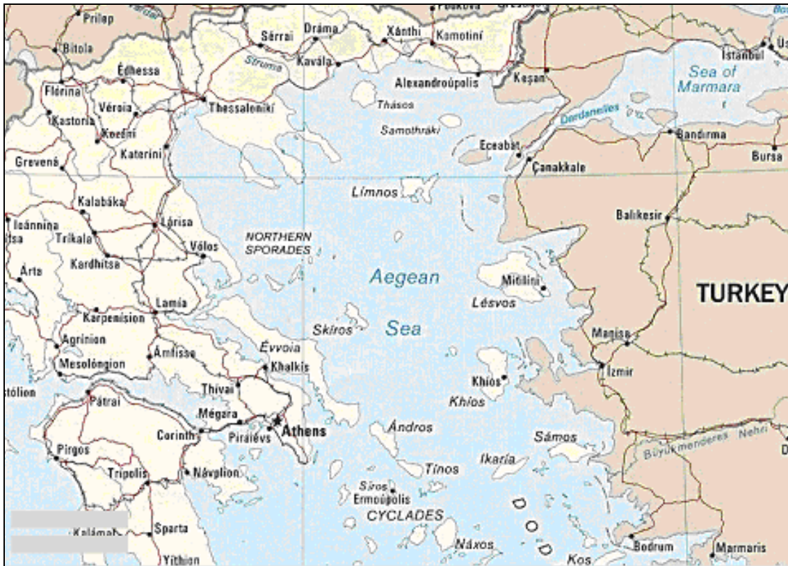
Figure 1: GIS mapping of the network.